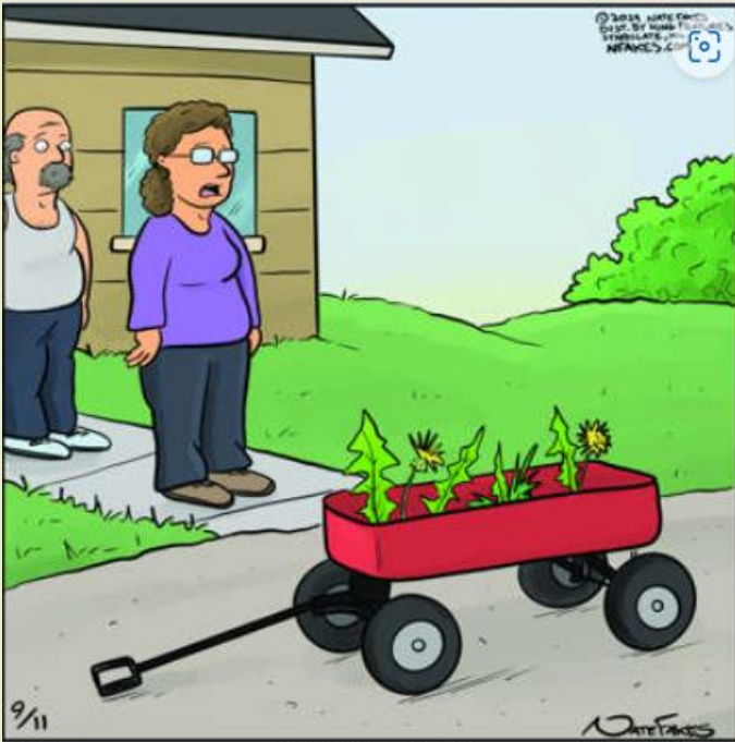
"Looks like the weeds need to be pulled."