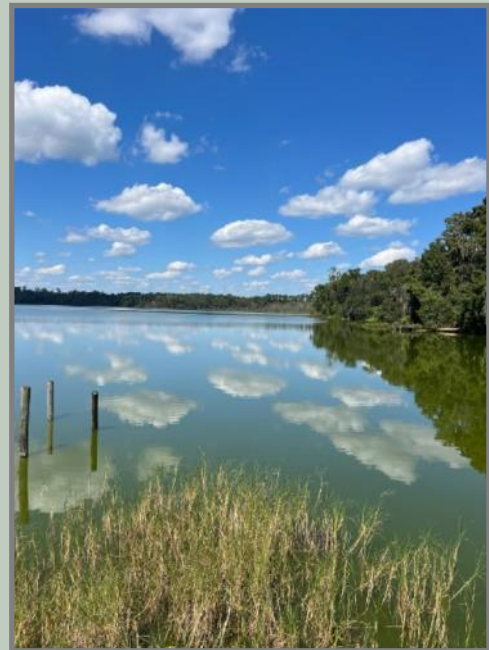
Biven's Arm, Gainesville Fl