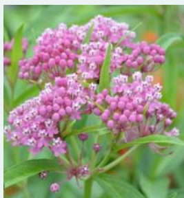
Swamp milkweed ( Asclepias incarnata )