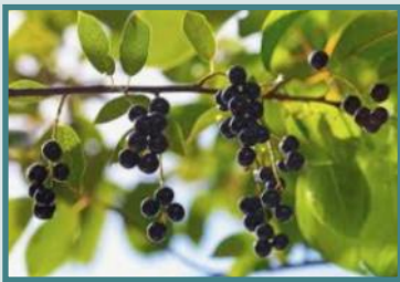
Hackberry ( Celtis occidentalis )