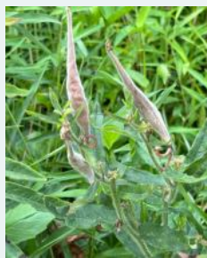
Butterfly weed In fall, with pods full of seeds