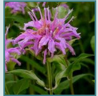
Wild Bergamot ( Monarda fistulosa )