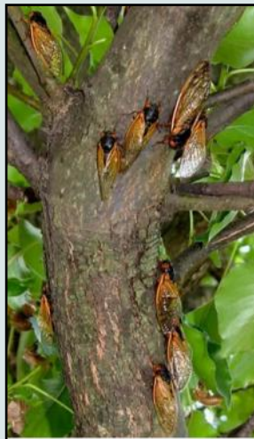
Brood XIV cicadas photographed in 2008. The cicadas emerge every 17 years.

This spring, residents can expect to see cicadas from Brood XIV, the cicadas that emerge every 17 years. States expecting cicadas this year include Georgia, Kentucky, Maryland, Massachusetts, New York, New Jersey , North Carolina, Ohio, Pennsylvania, South Carolina, Tennessee, Virginia and West Virginia.