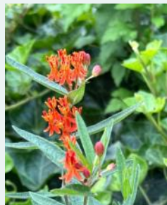
Butterfly weed ( Asclepias tuberosa )